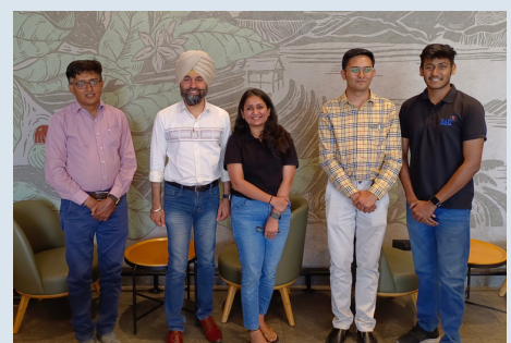
ICIB Rajasthan core committee members meeting held in Jaipur.