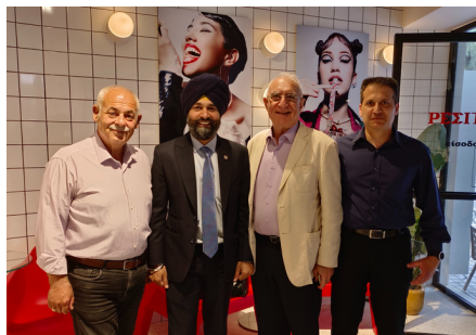
Meeting with Greek Indian Business Association: GIBA which is MOU partner in Greece