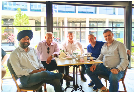
Meeting with importers of biodegradable packaging materials and stationary.