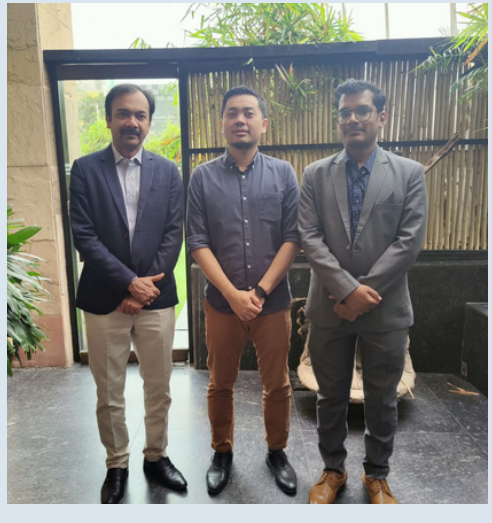
ICIB members meeting with Dy High Commissioner of Malaysia to New Delhi.